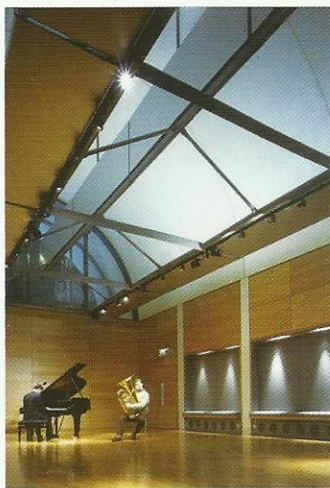
Royal Academy of Music