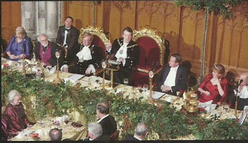
The Lord Mayor's Banquet