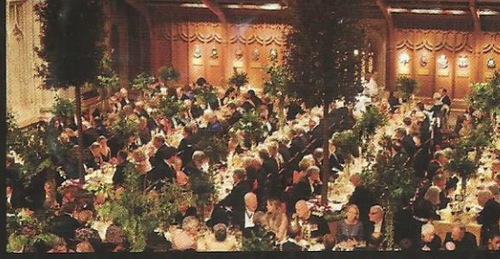
A woodland comes to Guildhall