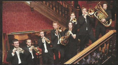
The Musicians at The Presentation Dinner

The Preserve Harmony editorial team would like to thank all those organisations and individuals, including many members of the Musicians' Company, for their kind help in supplying photographs. We regret that we have space to feature only a small fraction of all the excellent images received.