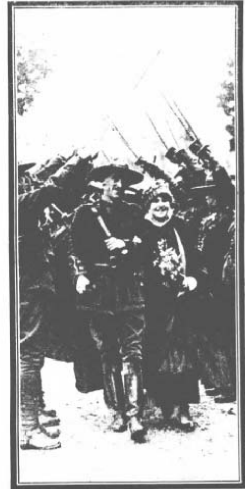
The happy pair pass under an archway of swords.