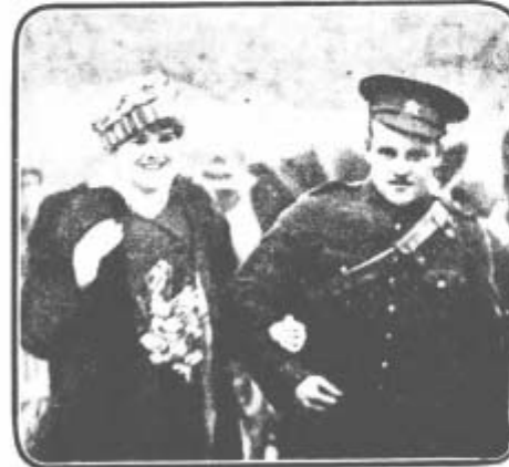
The bride, looking very happy, with her brother.