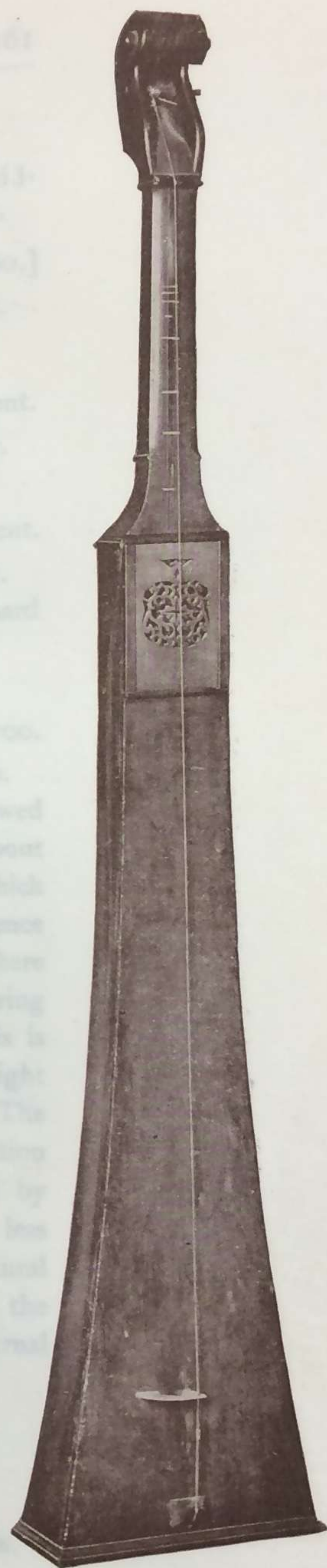
TROMBA MARINA. p.161 (Lent by F.W.Galpin)